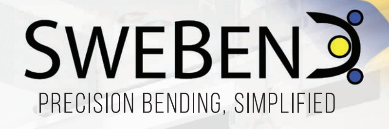
PLATE BENDING MACHINES